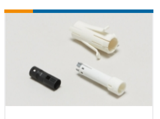
Plug & Socket Lighting Connector Accessories(1)