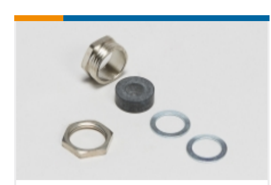
Circular Connector Hardware(1)