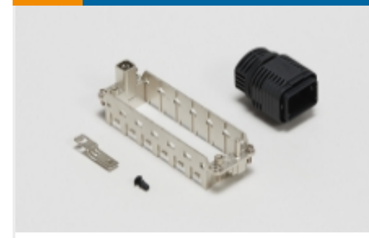
Rectangular Connector Hardware(13)