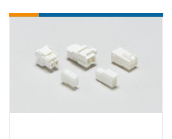
Rectangular Power Connectors(2)